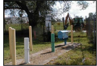
DEEP & SHALLOW TILL WELLS

A total of 132 wells were installed as part of EnviroSAFE's groundwater monitoring system; 31 wells monitor the bedrock formations, with other monitoring wells installed at the two contact zones discussed above. Each monitoring well is designed individually using either plastic or stainless steel casing. The well installation methods are very specific, and qualified professionals experienced in the techniques of monitoring well installation construct each well. Great care is taken to insure that the materials used for constructing the monitoring wells are free from any external contaminant sources. The ultimate goal for every groundwater monitoring well is to obtain groundwater samples representative of the groundwater at that particular level.